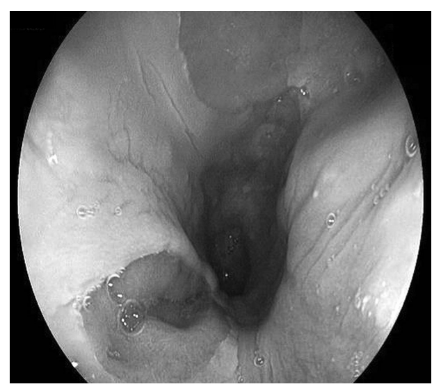
Figure 2. Inlet patch optical chromoendoscopic image.